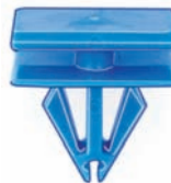
20976 (25742293) Blue Nylon

Rocker Panel Moulding Clip Top Head Size: 9/16" x 25/32" Bottom Head Size: 5/8" x 25/32" Stem Length: 9/16" Fits Into 3/8" Hole Cadillac DeVille & Seville 2000 - On