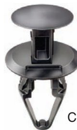
20888 (GM: 11561368; Chrys: 6508712AA) Black Nylon

Fender, Wheel & Bumper Push-Type Retainer Head Diameter: 18mm Stem Length: 20mm Panel Range: 3.0mm – 5.8mm Fits Into 9.5mm Hole GM 2004 – On Jeep Wrangler 2000 – On