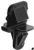
20964 (5159077-AA) Black Nylon

Rear Bumper Clip Stem Length: 15/32" Overall Length: 31/32" Jeep Grand Cherokee 2005 – On