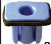
20947 (11561382, 11610198) Blue Nylon

Headlight Grommet With Sealer Head Size: 13mm x 20mm Overall Length: 19mm Pontiac G6 2005 - On