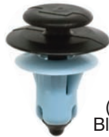
20949 (W711037-S300) Black & Blue Nylon

Door Trim Panel Retainer Top Head Diameter: 13mm Middle Head Diameter: 20mm Bottom Head Diameter: 16mm Stem Diameter: 8mm Stem Length: 12mm Ford Edge, Escape, Freestyle Mariner, Montego & 500 2005 - On