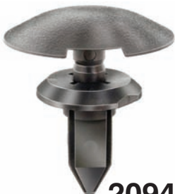
20940 (55157330-AC) Black Nylon

Tail Light Push-Type Retainer Large Head Diameter: 31mm Small Head Diameter: 20mm Stem Length: 21mm Fits Into 8mm Square Hole Jeep Commander 2006 – On