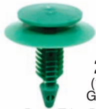
20944 (11588863) Green Nylon

Door Trim Panel Retainer Top Head Diameter: 18mm Bottom Head Diameter: 25mm Stem Diameter: 8mm Stem Length: 24mm Buick Terraza, Chevrolet Uplander, Pontiac Montana & Saturn Relay 2005 - On