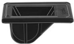
20962 (55156879-AB) Black Nylon

Tail Light Grommet Head Size: 20mm x 31mm Receives 10mm Ball Stud Jeep Commander 2006 – On