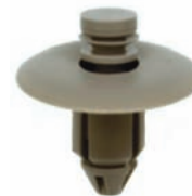
20948 (0WX68BD1-AA) Tan Nylon

Door Trim Panel Push-Type Retainer Head Diameter: 22mm Stem Length: 10mm Fits Into 9mm Hole Chrysler 300M and Dodge Charger & Magnum 2005 – On