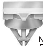
20982 Not Available From O.E.M. White Nylon

Fender & Wheel Flare Moulding Clip Top Head Size: 14mm x 18mm Bottom Head Size: 17mm x 21mm Stem Length: 13mm Fits Into 9mm Hole Jeep Commander 2006 – On