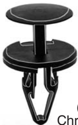
20988 (GM: 11589289; Chrysler: 6508863-AA) Black Nylon

Air Distributor & Windshield Defroster Push-Type Retainer Head Diameter: 18mm Stem Length: 17.5mm Panel Range: 2.0mm – 4.5mm Fits Into 6.5mm Hole GM 2002 – On Chrysler