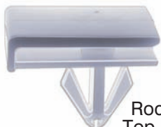
20972 (11589176) White Nylon

Rocker Panel Moulding Clip Top Head Size: 3/4" x 1-1/32" Bottom Head Size: 19/32" x 1-1/32" Stem Length: 9/16" Fits Into 3/8" Hole Chevrolet Malibu 2004 - On