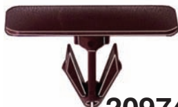
20974 (10352804) Maroon Nylon

Rocker Panel Moulding Clip Head Size: 15/32" x 1-9/32" Stem Length: 11/16" Fits Into 5/16" Hole Chevrolet Impala, Lumina & Monte Carlo 2000 - On