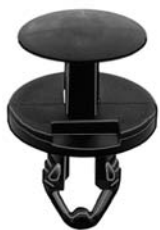
20990 (GM: 15296830; Chrysler: 5116530-AA) Black Nylon

Fascia & General Purpose Push-Type Retainer Head Diameter: 19mm Stem Length: 16mm Panel Range: 5.0mm – 7.0mm Fits Into 8mm Hole GM 2007 – On Chrysler