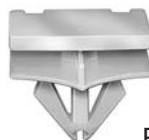
20952 (15236894) White Nylon

Rocker Panel Moulding Clip Top Head Size: 9/16" x 23/32" Overall Height: 5/8" Stem Length: 7/16" Fits Into 3/8" Hole, Buick Lucerne and Cadillac CTS & STS 2003 - On