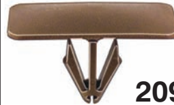
20973 (10352798) Tan Nylon

Rocker Panel Moulding Clip Head Size: 11/16" x 1-5/16" Stem Length: 11/16" Fits Into 5/16" Hole Chevrolet Impala, Lumina & Monte Carlo 2000 - On