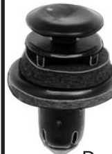
20946 (W711017-S300) Black Nylon

Door Trim Panel Retainer With Sealer Top Head Diameter: 14mm Middle Head Diameter: 14mm Bottom Head Diameter: 20mm Stem Diameter: 9.5mm Stem Length: 16mm Ford Fusion 2006 - On