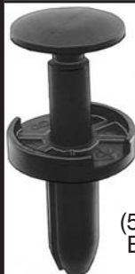
20966 (5160260-AA) Black Nylon

Rear Bumper, Tail Light And Fender Push-Type Retainer Bottom Head Diameter: 18mm Stem Length: 20mm Fits Into 8mm Hole Dodge Caliber and Jeep Compass & Patriot 2007 – On