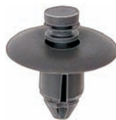
21021 (0WX68BD5-AA) Gray Nylon

Door Trim Panel Push-Type Retainer Head Diameter: 22mm Stem Length: 10mm Fits Into 9mm Hole Chrysler Charger, Magnum & 300M 2005 – On